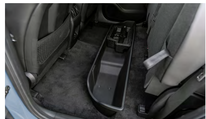
Standard 60/40 fold-up rear seat cushions Rear seat cushions can fold up with a 60/40 split to meet your cargo needs. They also feature removable cargo trays underneath to stash away your gear.