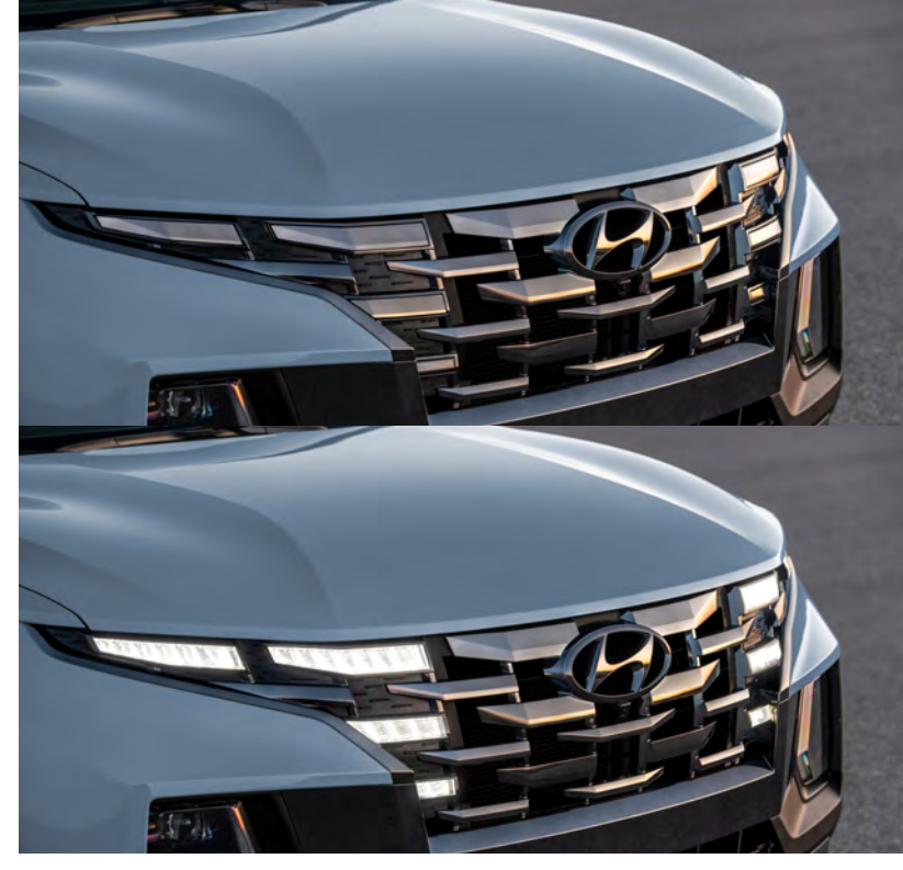
Standard hidden LED daytime running lights

The tough yet alluring modern design of the SANTA CRUZ makes efficient use of its compact dimensions by offering excellent manoeuvrability, making it a joy to park in challenging urban areas. The hidden LED daytime running light design draws you in, becoming visible within the grille only when illuminated. Available 20" alloy wheels are framed by rugged wheel arches that hint to its off-road capability.