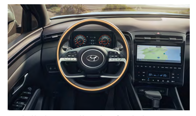
Standard leather-wrapped heated steering wheel Bring on early mornings with the comfort of the heated steering wheel.