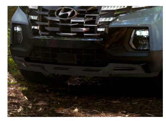
Black front/rear skid plates