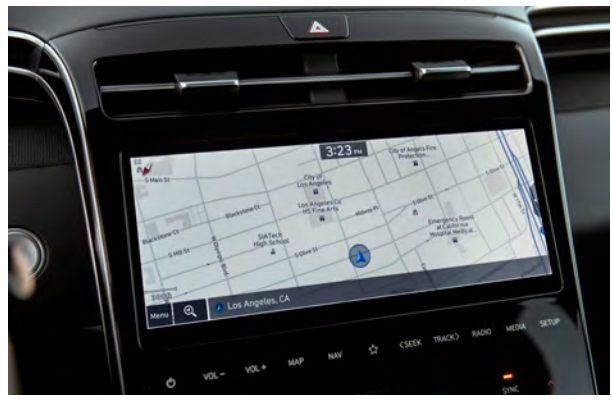
Standard 10.25" touch-screen with navigation and available surround view monitor

Adding to the comfortable cabin is a wealth of technology that will help keep you connected throughout your journey and make the little things more convenient.