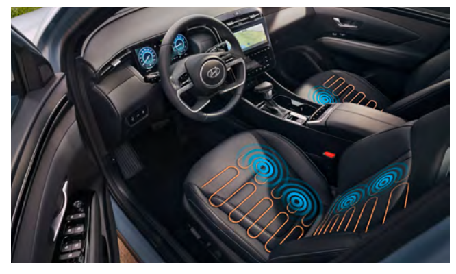
Standard heated front seats and available ventilated front seats Enjoy the drive, not just the destination. Warm up with heated front seats and cool off all summer long with available ventilated front seats.