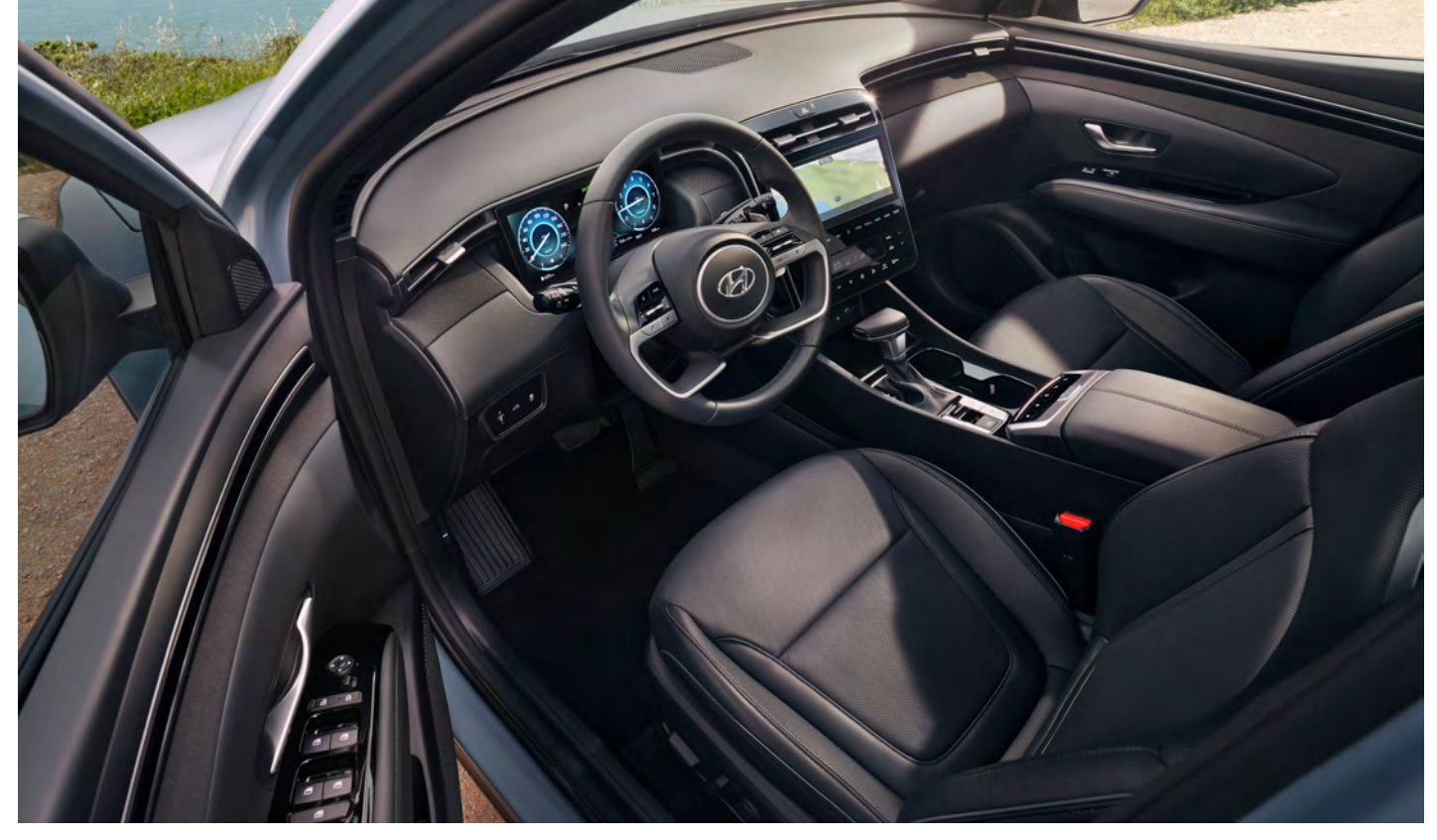
Ultimate 2.5T model shown.

The interior design of the SANTA CRUZ prioritizes ergonomics and features that deliver comfort all journey long. The driver's seat is positioned for optimal leg space and can be further customized with an available 8-way power driver's seat with lumbar support. The centre stack is angled slightly towards the driver for ease of view and features standard dual-zone automatic climate control, so you and your co-adventurer can choose your own temperature to your own liking.