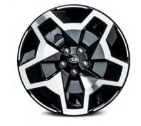
20" machined alloy wheels Available on Preferred model with Trend package