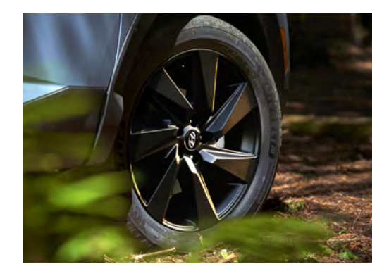
Available 20" black alloy wheels