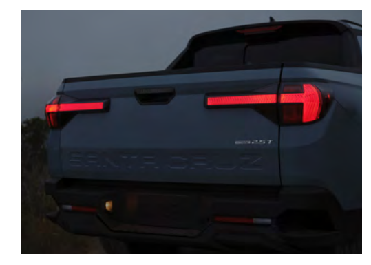
Available T-shaped LED tail lights