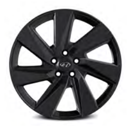
20" black alloy wheels Standard on Ultimate model

*Exterior and interior colour options and/or availability may change without notice. Choice of interior colour is dependent on model and/or exterior colour selection. Colours shown are for reference only and may vary from the actual hue. Visit hyundaicanada.com or see your dealer for details.