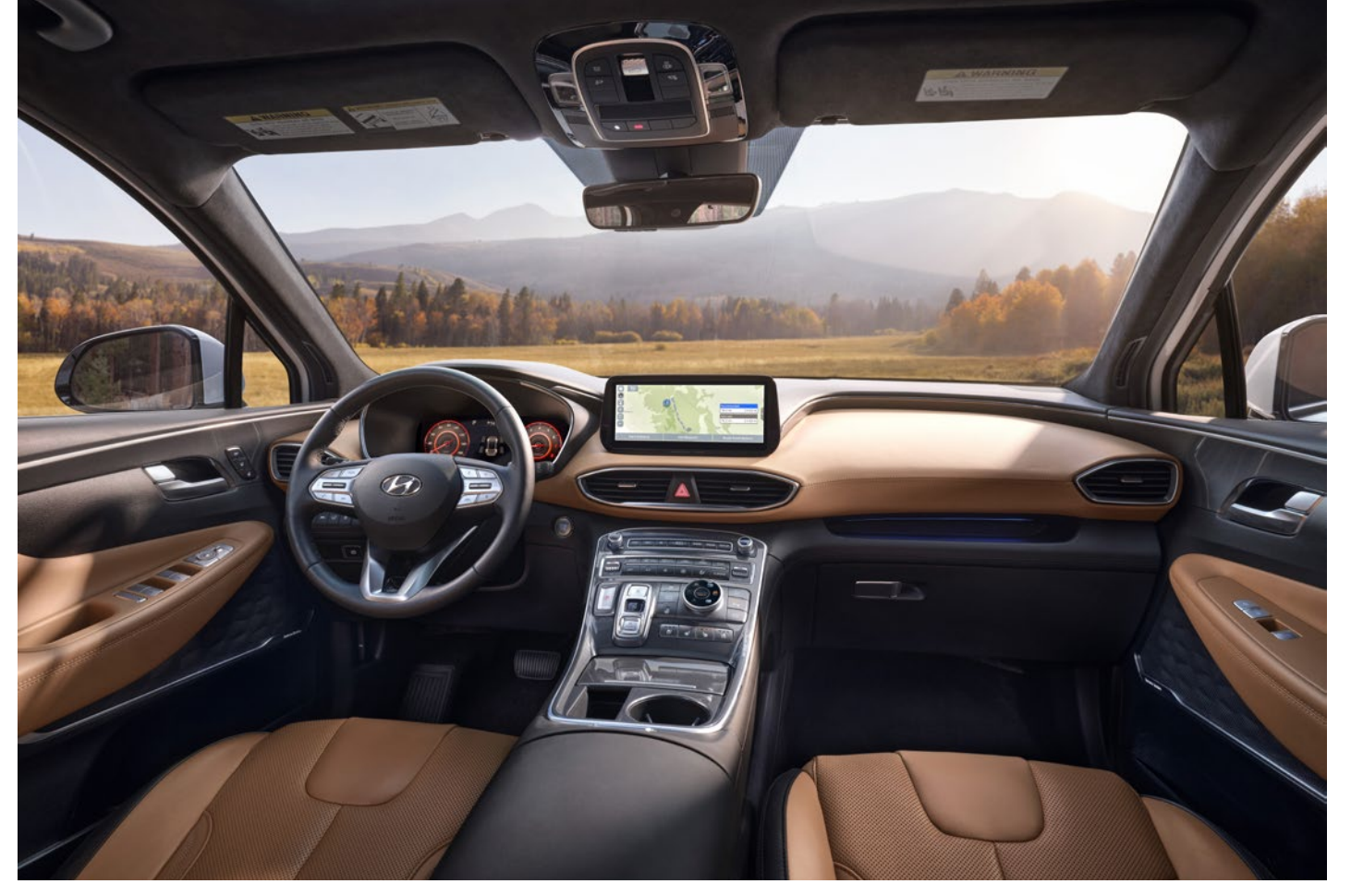
Ultimate Calligraphy model shown. May not be exactly as shown.

A sophisticated floating centre console design sets the stage for the luxury you are surrounded by. The interior of the SANTA FE features a convenient shift-by-wire layout that replaces the traditional gear shifter configuration with intuitive button selection, offering a clean design and maximized storage space. The spacious cabin feels even larger when the available panoramic sunroof is wide open on a beautiful sunny day.