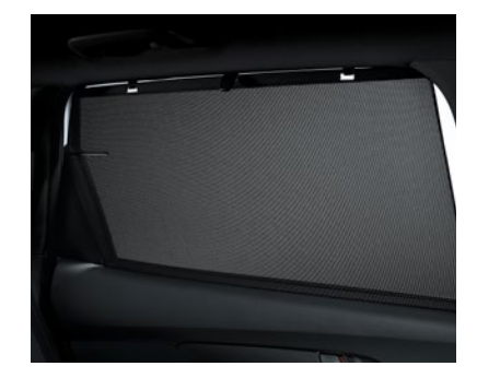
Available rear window sunshade blinds