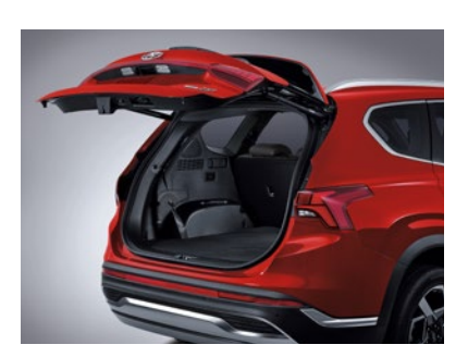
Available smart power liftgate