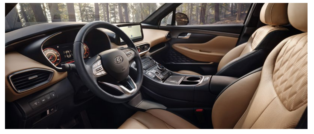
Quilted Nappa leather Available quilted Nappa leather makes the luxurious interior even more of an indulgent experience.

The SANTA FE helps make your drive a safer one. It thinks of everyone's safety.