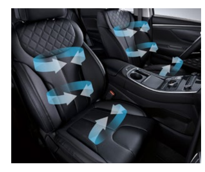
Standard heated front seats and available ventilated front seats