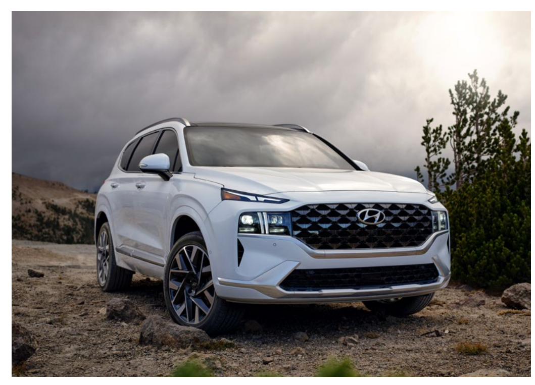
Standard LED headlights and LED daytime running lights with signature T-shaped design

Up front, the grille showcases a balanced design with a unique T-shaped lighting signature, featuring LED headlights and LED daytime running lights. A sharp side character line runs alongside the shoulder, delivering a muscular stance that seamlessly flows into the unique LED tail light design which is connected end-to-end by a centre reflector strip. Every angle has been elegantly crafted.