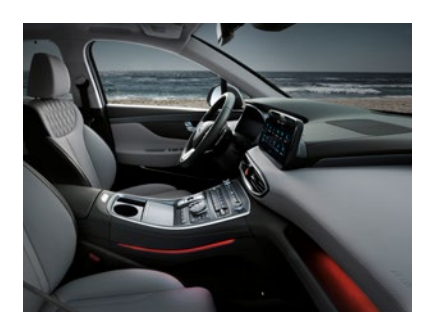
Available interior ambient lighting