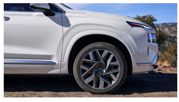
Available 20" alloy wheels