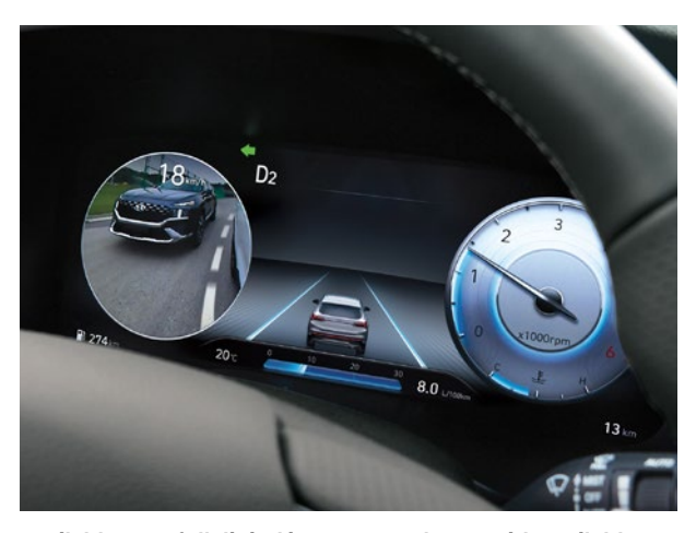
Available 12.3" full digital instrument cluster with available Blind View Monitor

The Remote Smart Parking Assist system¹ allows you to remotely move the SANTA FE when you are outside of the vehicle — a very convenient feature when you have large items to load in a tight area. Simply use the key fob to move the SANTA FE forward or backwards, into or out of the parking space.