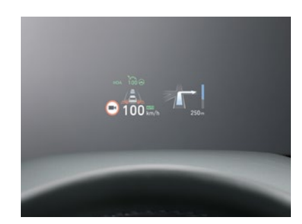
Available head-up display

Enjoy the convenience that a wide range of SANTA FE features will bring into your life. For instance, the available smart power liftgate lets you load up your cargo hassle-free, while the available surround view monitor makes parking easier with a 360-degree aerial view of your surroundings. You can even charge your smartphone by just slotting it into the available wireless device charging area.