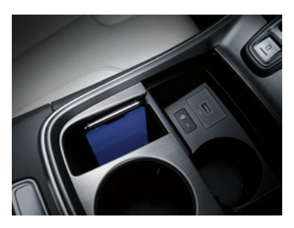
Available wireless charging pad ♥