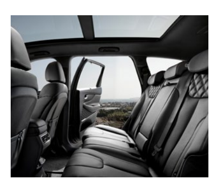
Available panoramic sunroof