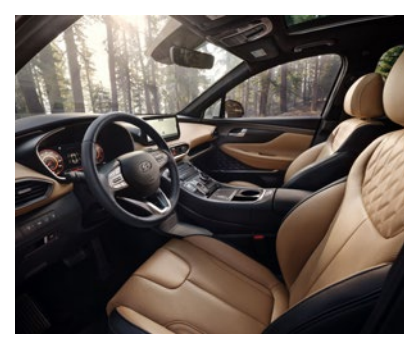
Available 8-way power-adjustable driver's seat with lumbar support and power thigh extension