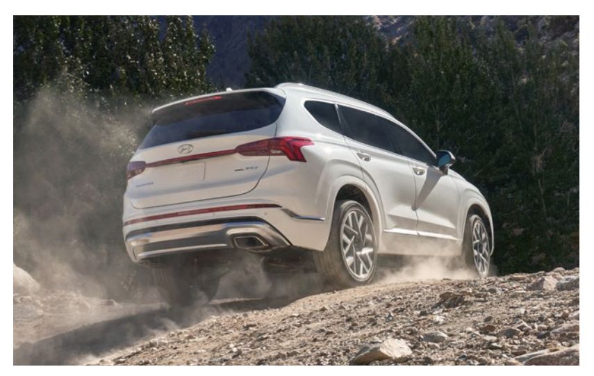
Standard HTRAC™ All-Wheel Drive with multi-terrain control modes

For the ultimate in handling, performance and traction, enjoy our HTRAC™ All-Wheel Drive system. It allows you to select the appropriate traction setting that best suits your driving conditions with three dedicated terrain modes. Choose from Snow, Mud or Sand.