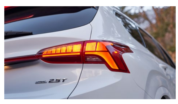
Available LED tail lights