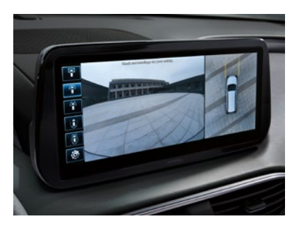
Standard 10.25" touch-screen with navigation and available surround view monitor