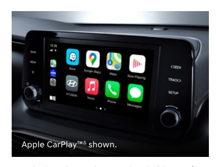
Standard Apple CarPlay™∆ and Android Auto™◊