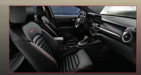
GT INTERIOR TRIM including sport bucket seats with red stitching, and ambient mood lighting

1.6 L TURBOCHARGED GDI ENGINE delivers 201-horsepower and up to 195 lb.-ft. of torque