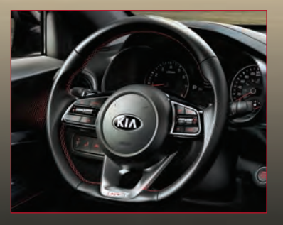
D-CUT SPORT STEERING WHEEL with red stitching and steering wheelmounted paddle shifters