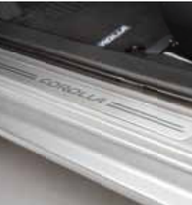
Door Sill Protector